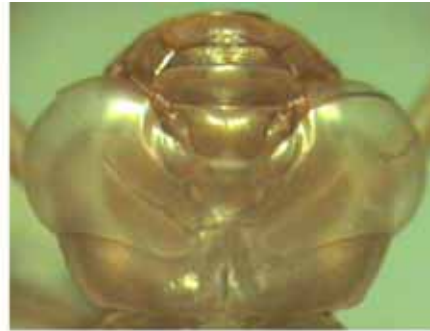
Aeshna canadensis - head rounded, eyes short