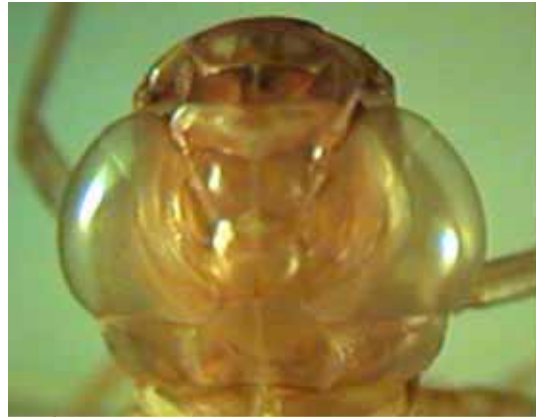
Anax junius - head rounded, eyes long