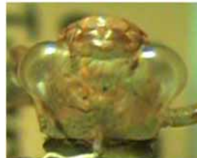
Basiaeschna janata - Head trapezoidal; head less abruptly narrowed

The most widespread aeshnid genera are best identified by head shape.