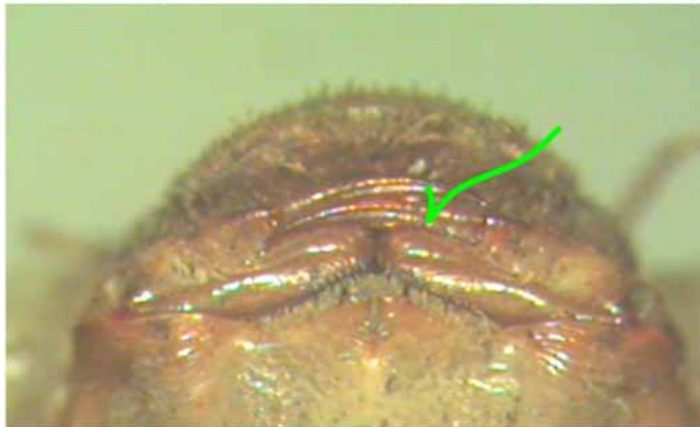
Boyeria vinosa - note blunt tip of labial palp. Larvae also have vividly banded legs.