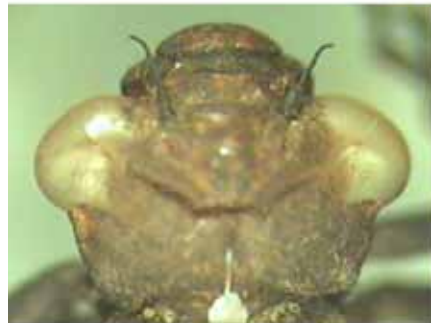
Boyeria grafiana - Head trapezoidal, head abruptly narrowed behind eyes